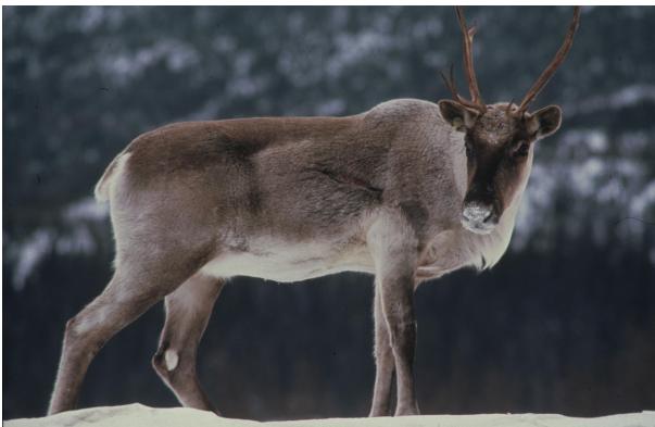
Figure 1. Woodland caribou, Qu bec, Canada.

Globally, changes in habitat have been identified as the ultimate cause of the recent caribou decline throughout the species historic range (Vors and Boyce 2009). The spatial association between residual mature forests and cutovers or regenerating stands forces caribou to use habitats where predation risk might be higher (Hins et al. 2009; Dussault et al. 2012) and current forest harvesting configuration strategies could be creating ecological traps (Delibes et al. 2001; Battin 2004). Anthropogenic disturbances, including roads, cabins, and industrial sites, are recognized as having a negative influence on caribou and reindeer behavior well beyond the local footprint of these disturbances (Vistnes and Nellemann 2008; DeCesare et al. 2012). These anthropogenic features are having