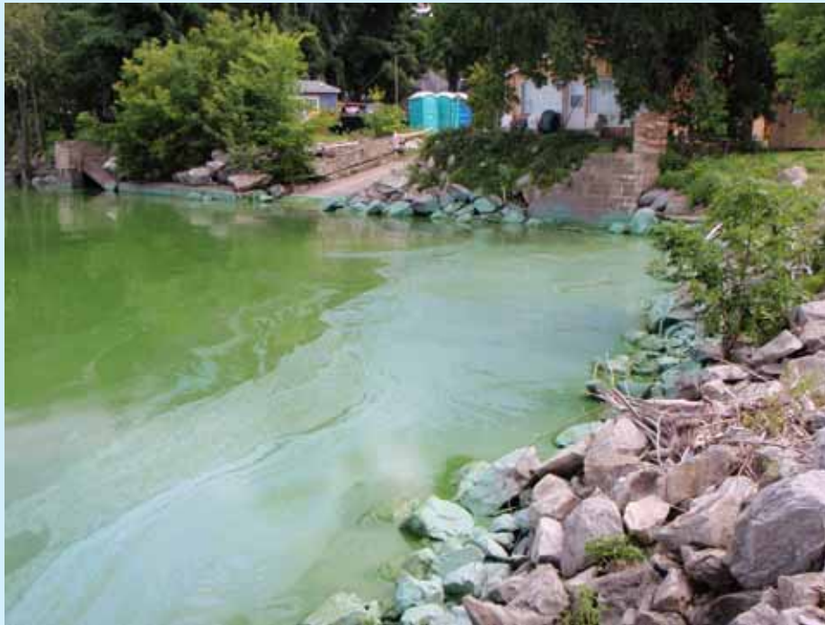
Figure 2 Accumulation of a cyanobacterial scum

Lakeshore accumulation of a cyanobacterial scum in Missisquoi Bay, Lake Champlain, Quebec in mid-summer 2008. These noxious blooms are costly and dangerous to the health of those who depend on the lake for drinking water. Modelling of historical data has shown that three conditions must be met in order for a large bloom to occur: there must be an abundant supply of both nitrogen and phosphorus available to the plankton and the water temperature must be elevated. Increasing average water temperature over the past 15 years has been accompanied by increased bloom growth.