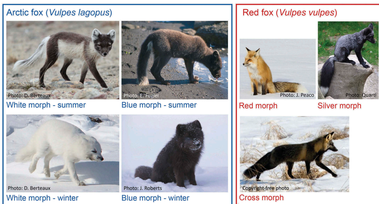
Figure 2. The two most common colour morphs (summer and winter pelage) of the Arctic fox and the three most common colour morphs of the red fox.

Variability in fur colour of the Arctic fox sometimes generates confusion, as it is widely assumed that Arctic foxes are always white. Such confusion is enhanced by the also variable colouration of the red fox ( Vulpes vulpes ), which can share the same habitat as the Arctic fox. Fur colouration is complex in these species and Adalsteinsson et al. (1987) distinguished four colour phenotypes in the Arctic fox and seven in the red fox. Most Arctic foxes, however, appear in one of two distinct colour morphs: white (most individuals) and blue. The proportion of the two morphs varies geographically. In summer, the white morph turns brown-grey and yellowish-white. The blue morph remains dark charcoal all year round, but becomes lighter in winter. Red foxes are usually reddish-brown to yellow (red morph), but sometimes mostly black (silver morph) or a combination of both (cross fox) (Butler 1945). Figure 2 illustrates these various pelage colours. Arctic and red foxes are easy to distinguish as the red fox is bigger and has proportionally longer ears and a pointier nose.