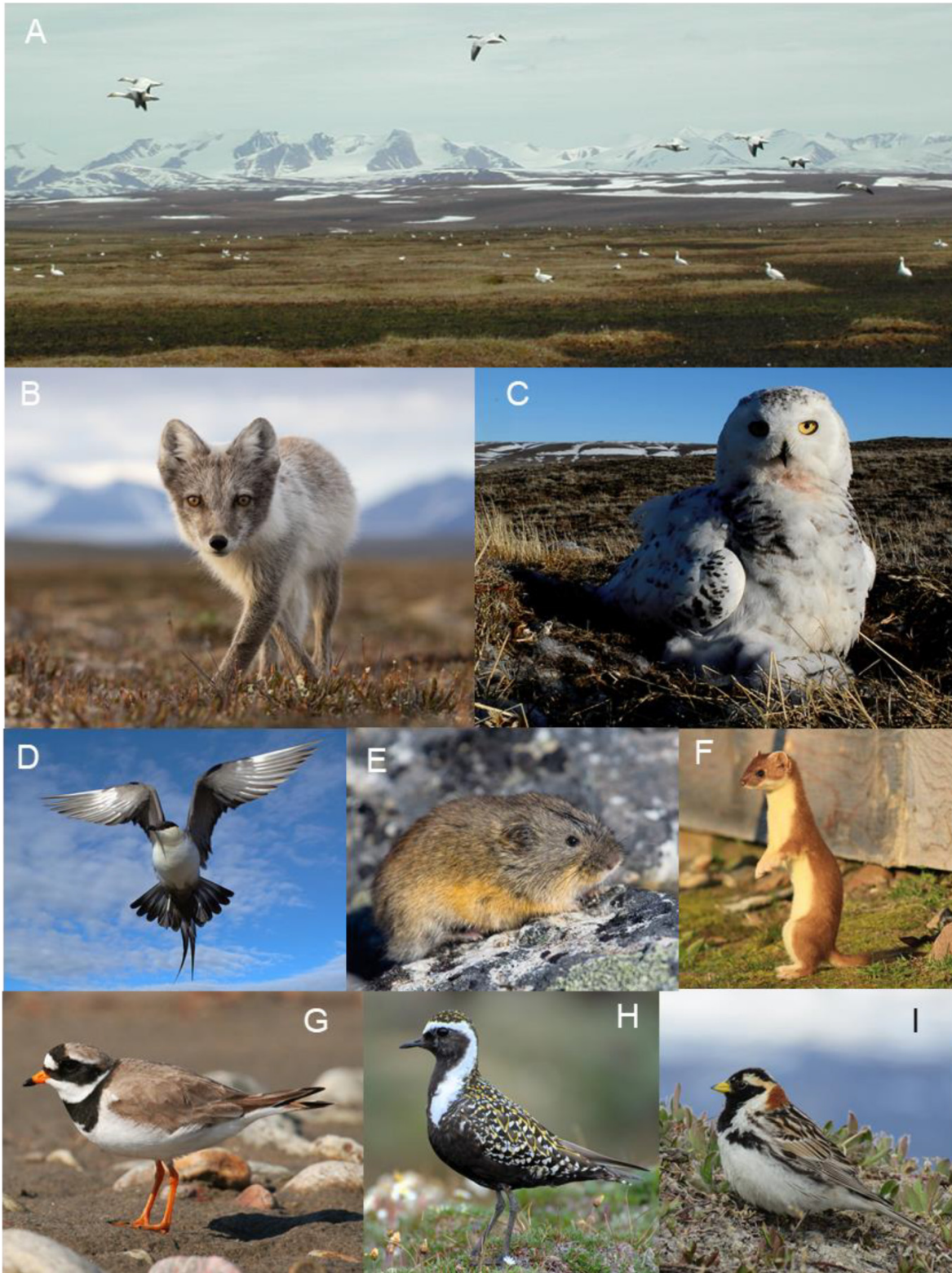
Fig. 3. Photographs of the major wildlife species studied at the Bylot Island Field Station: Greater snow goose (A, view of the colony), Arctic fox (B), snowy owl (C), long-tailed jaeger (D), brown lemming (E), ermine (F), shorebirds (common ringed plover (G) and American golden plover (H)) and Lapland longspur (I).