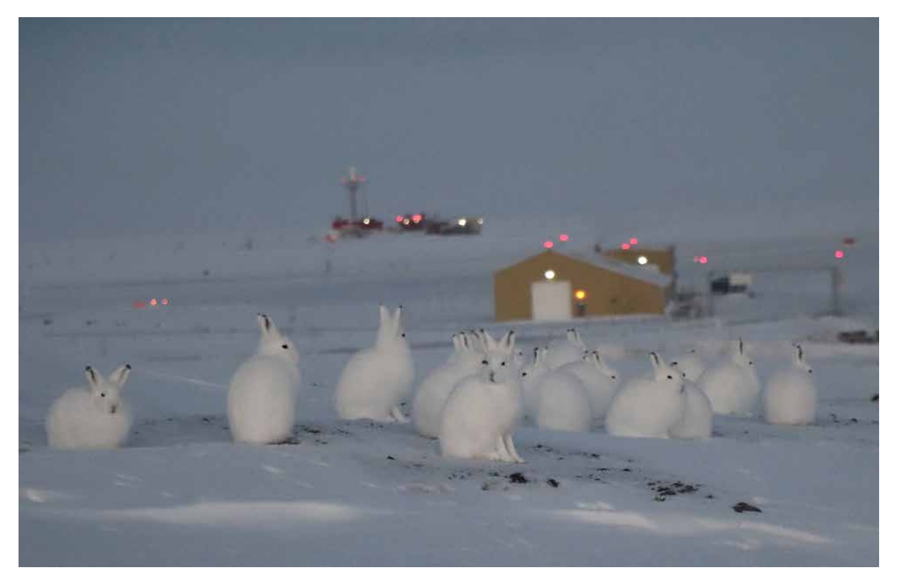
Figure 2. The existence of seasonal migrations is strongly suspected but still not demonstrated in some Arctic terrestrial mammals. Such is the case for these Arctic hares photographed in late October 2020 at Canadian Forces Station Alert (Ellesmere Island, Canada), 817 km from the North Pole.

A first step to answer this question is to better document and monitor migrations in Arctic terrestrial mammals. The existence of migration is still not adequately tested in many species (Figure 2), variation in movement patterns across populations is usually unknown, and micro-migrations of small mammals are